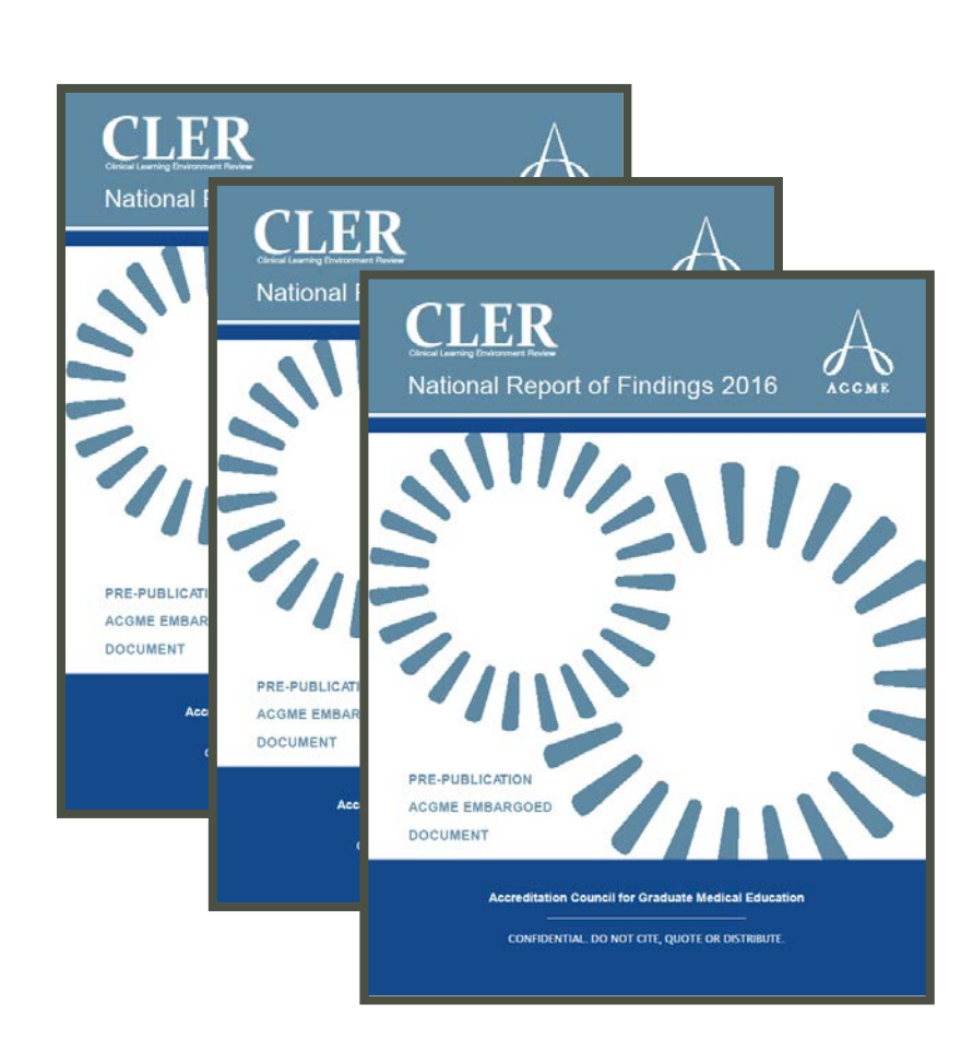
Issue Briefs to follow