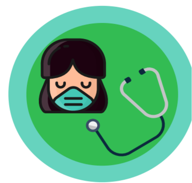
Clinical Trial Operations