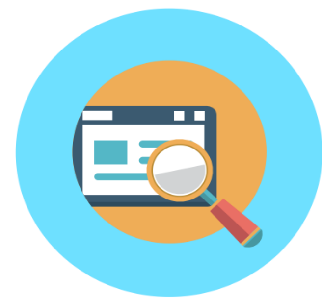
Research Integrity Team

The Office of Clinical Research (OCR) at JPS Health Network was established in 2017 to centralize research throughout the network